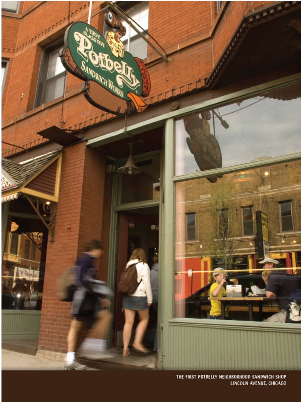
THE FIRST POTBELLY NEIGHBORHOOD SANDWICH SHOP LINCOLN AVENUE, CHICAGO